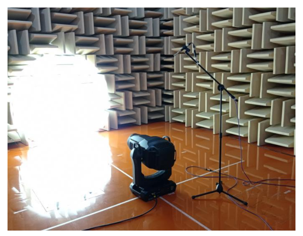
Figure 1: Test setup

The product was placed indoors in a semi-anechoic room in the internal Lab of Harman Technology in Shenzhen, China (See Figure 1). The ceiling and walls were all acoustically absorbent and the floor was reflective. The main dimensions of the room were 5.9m * 4.9m * 3.3m (length * width * height).